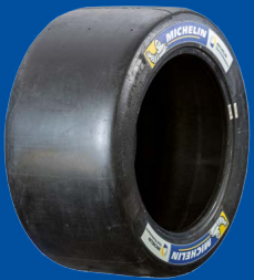
HYBRID (SLICK INTERMEDIATE)